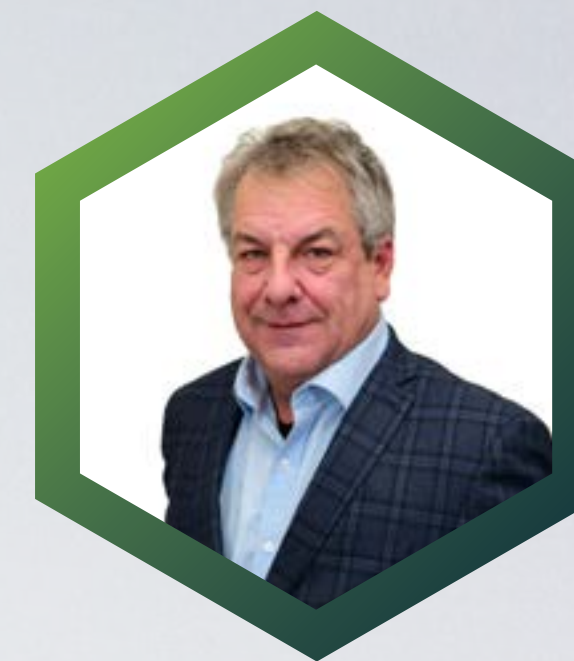
SIMON CURTIS DIRECTOR